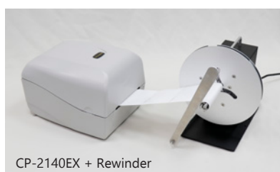
CP-2140EX + Rewinder